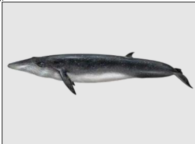
Figure depicting a Rice's whale