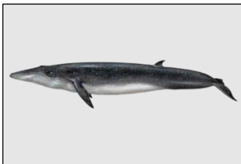
Figure depicting a Rice's whale